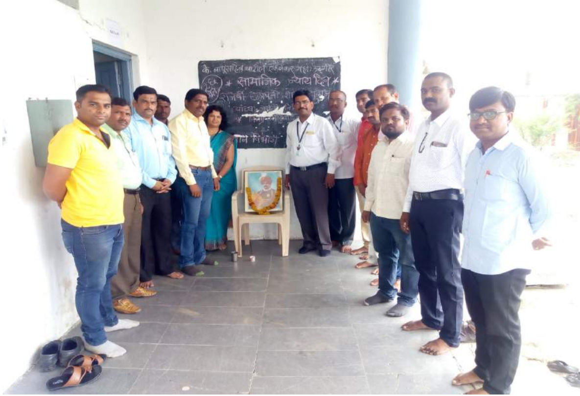
Celebration of Rajarshi Shahu Maharaj Jayananti by all staff