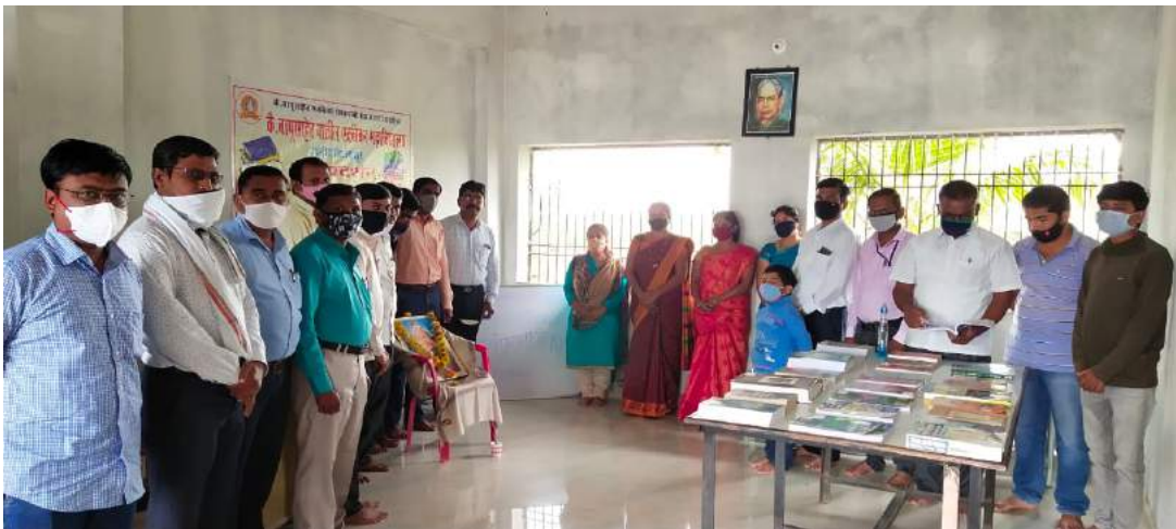
(The staff while celebrating the Birth anniversary of Dr. A.P.J. Abdul Kalam)

All rules and regulation related to Covid-19 were followed during the programme.